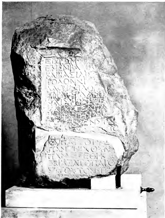
THE GRAVE STONE OF ABERCIUS